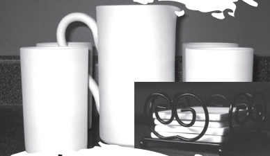
Iced Tea Please