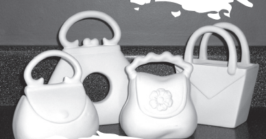
Let's Go Shopping