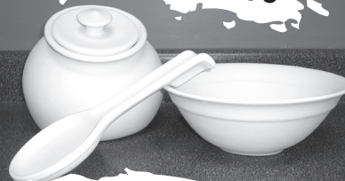
Kids Love to Cook