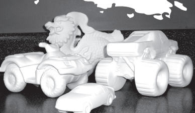
Let's Hear it for Boys